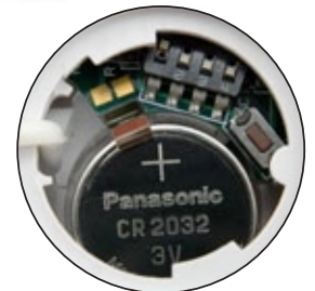
Personalize user settings: °C/°F, Resolution (0.1° or 1°), and Auto off