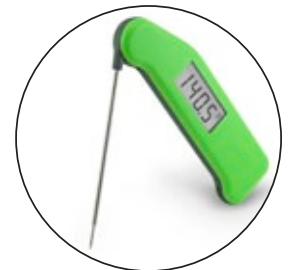
No buttons to press or learn makes staff training a breeze