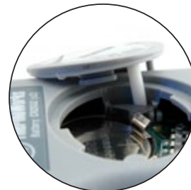
Battery cover is tethered so it will never get lost

Just open the probe and the Thermapen comes on. Close it and it shuts off. No buttons or switches to catch germs, confuse staff and cause errors. Configuration settings in the battery compartment allow management to easily set the Thermapen for °C or °F, read in tenths or whole degrees (0.1° or 1°), and disable the auto-off for continuous readings till the probe is closed. Although likely to never be needed, a calibration trim button fine-tunes the Thermapen calibration at a single temperature such as an ice-bath.